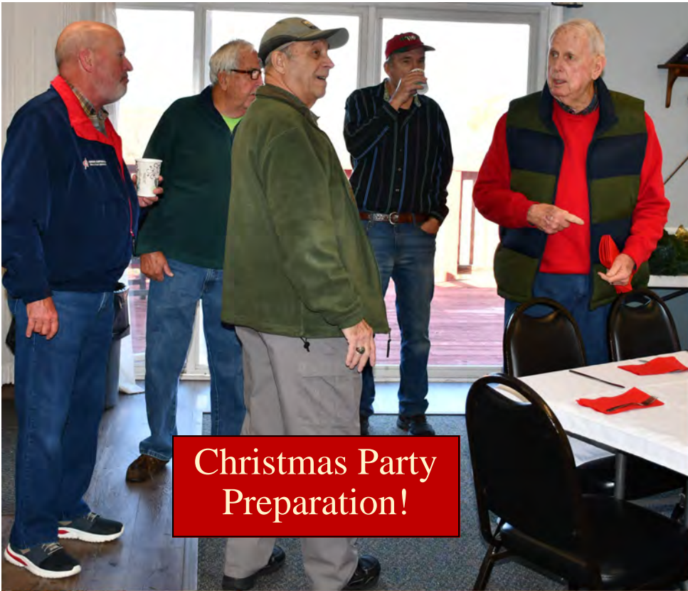
Christmas Party Preparation!