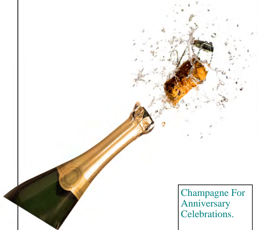
Champagne For Anniversary Celebrations.