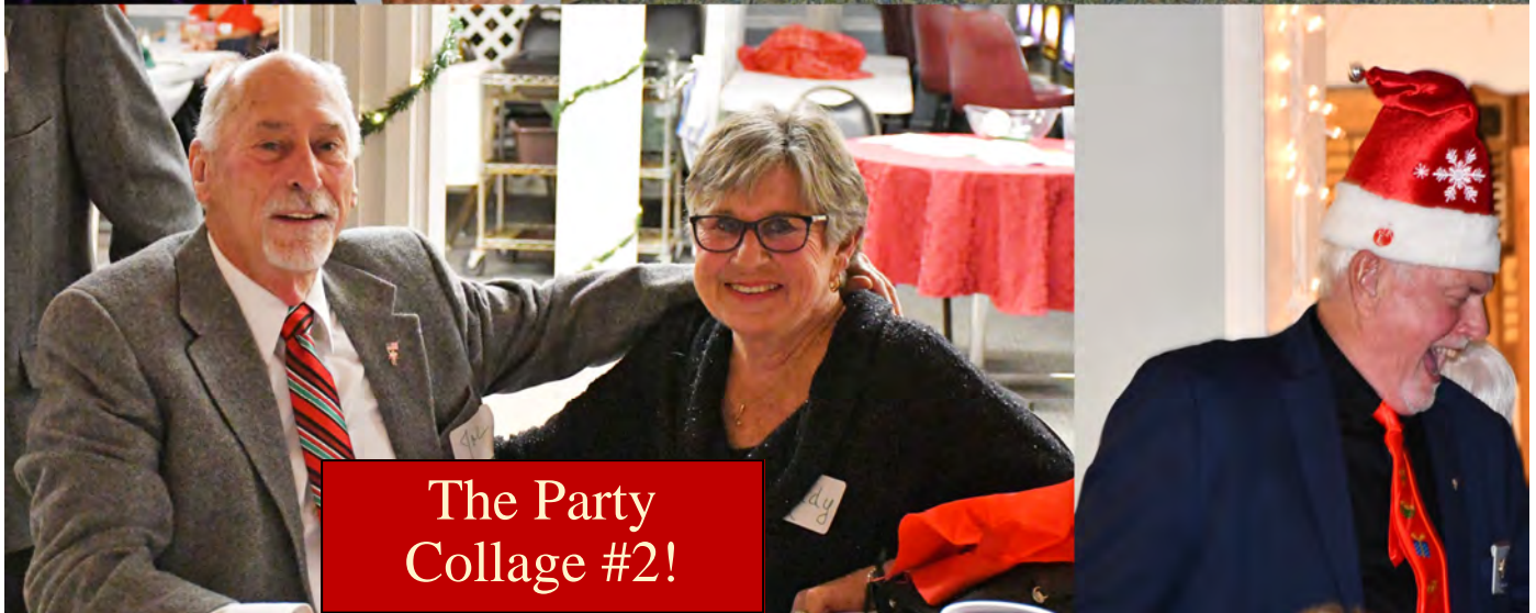
The Party Collage #2!