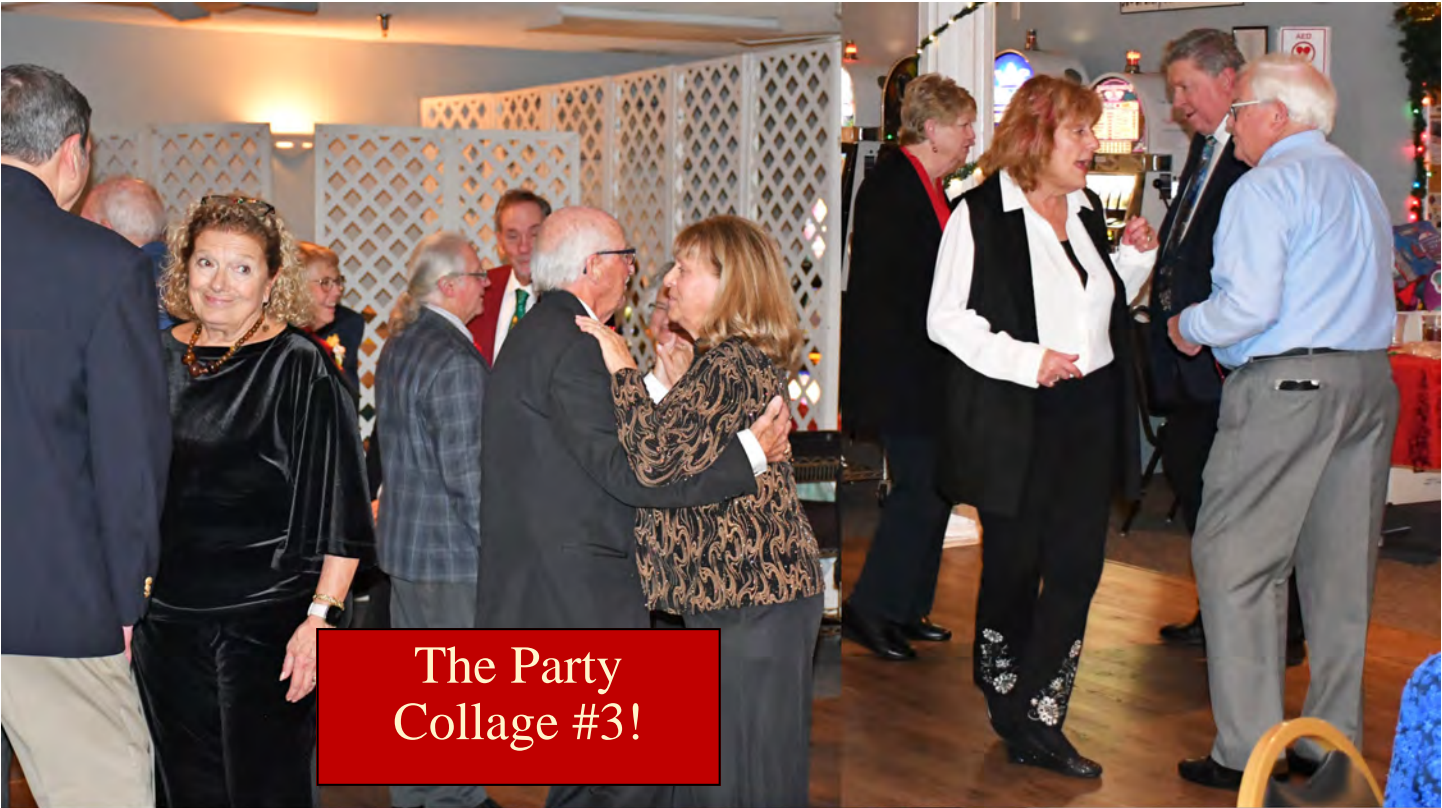
The Party Collage #3!