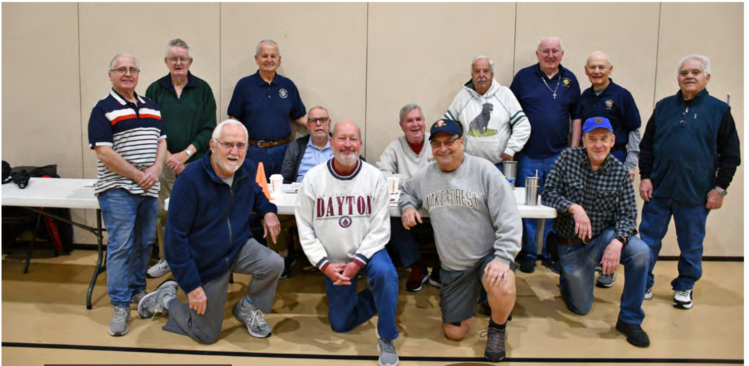
What a great crew we had. Great eh?