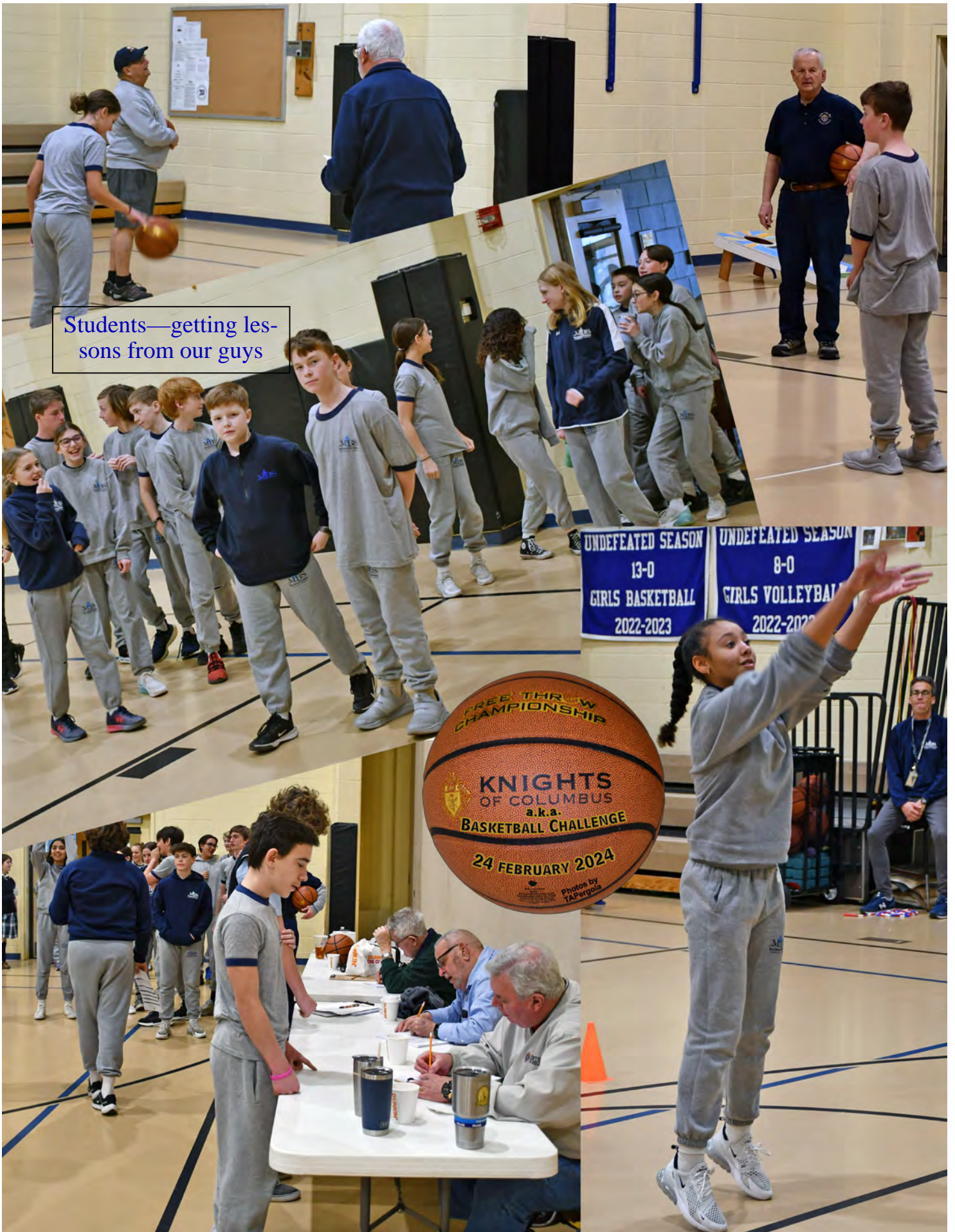
Students—getting lessons from our guys