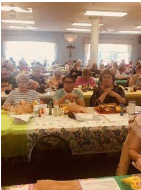
Ladies' BINGO Luncheon