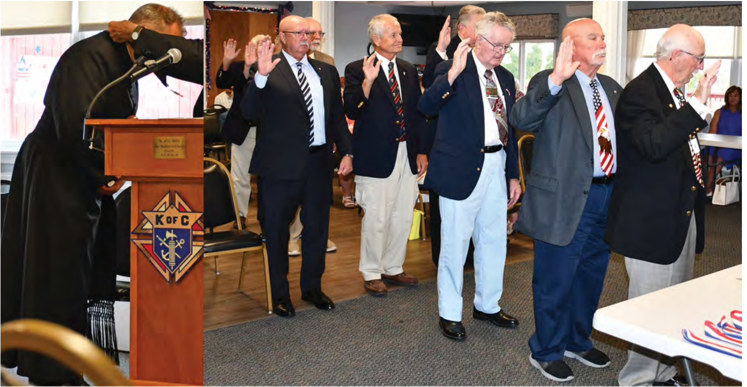
COUNCIL #9053 PLEDGE/OATH 24 JULY 2024