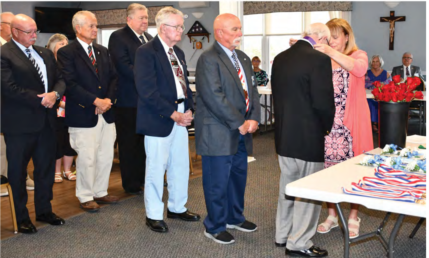
COUNCIL #9053 JEWEL PRESENTATIONS 24 JULY 2024