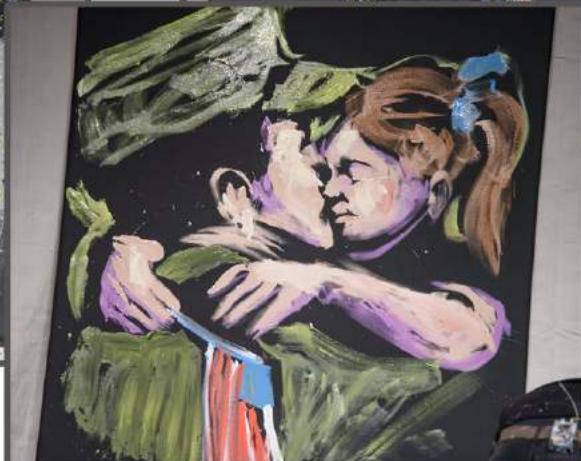
A Soldier in Uniform holding his Child