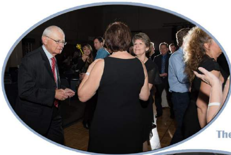
The Dance Floor