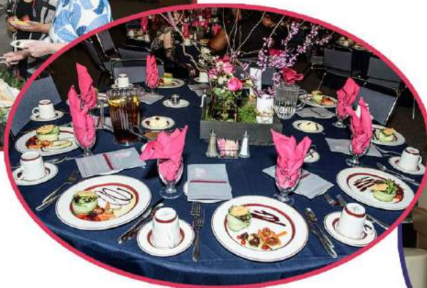
Surf and Turf Dinner