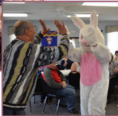
PETER RABBIT ARRIVES AND GREETES THE GUESTS