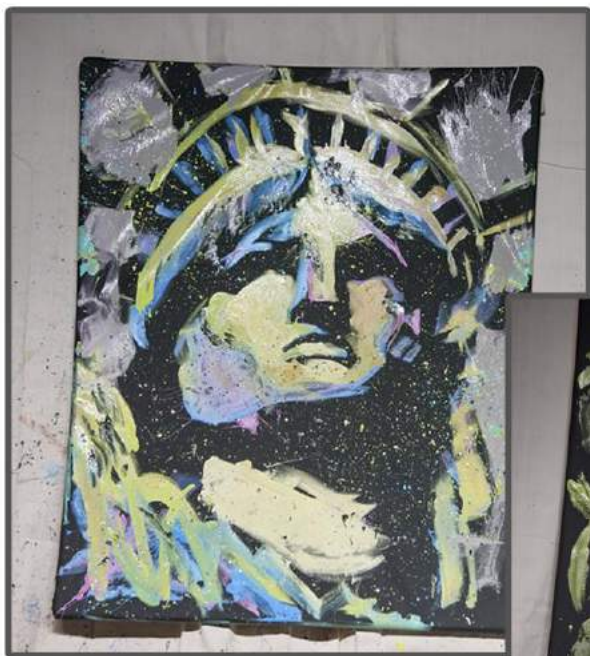
The Head of the Statue of Liberty