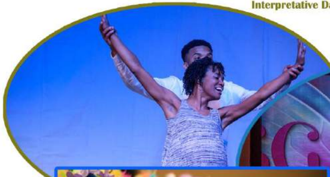
Interpretative Dance – “The life of One of Our Mothers”