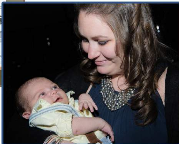
What the SGPC Gala is all about ...