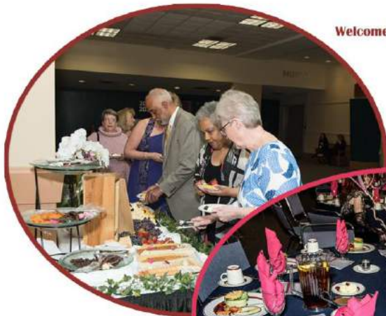
Welcome Reception with light Hors d'oeuvres