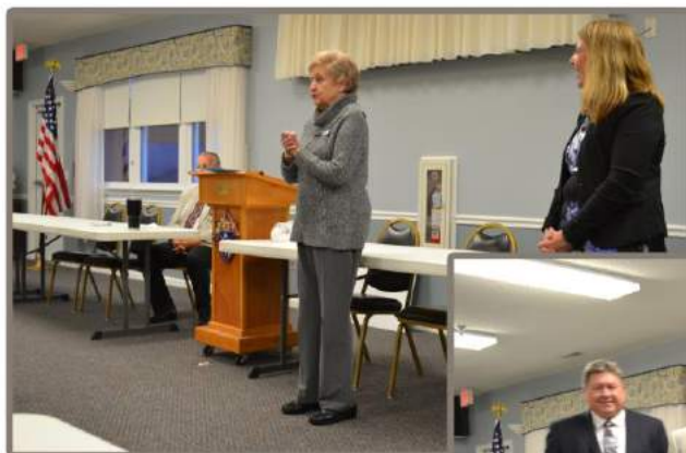
Pictured below Left to Right: