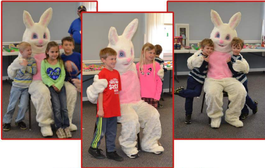
PETER RABBIT POSES FOR PICTURES WITH THE GUESTS AND HELPERS