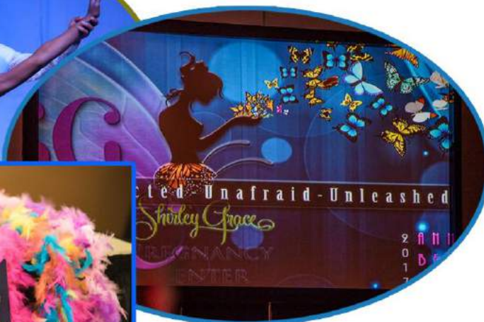
Video Presentations – “A fearless Young Woman”