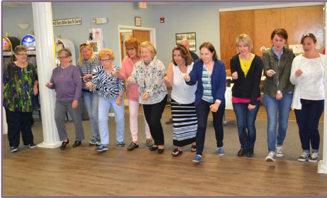
MOMS AND GRANDMOTHERS TRYING THE EASTER EGG-CARRYING CHALLENGE