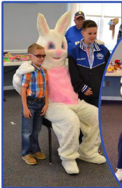
PETER RABBIT POSES FOR PICTURES WITH THE GUESTS AND HELPERS