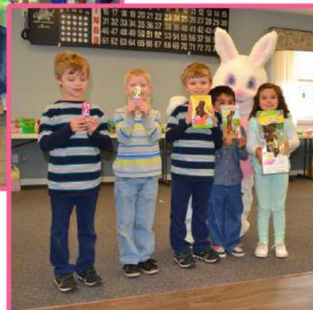
EASTER EGG-CARRYING CHALLENGE WINNERS BY AGE GROUP