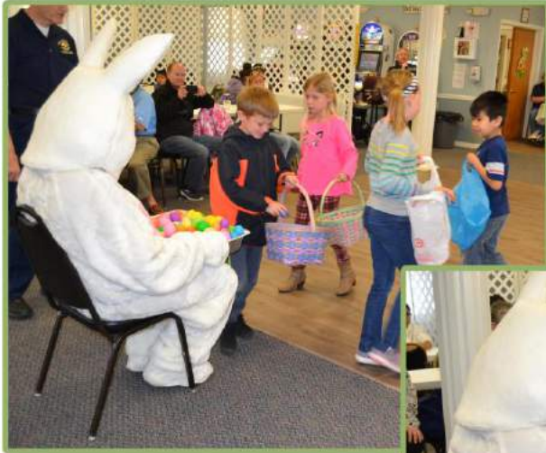
GUESTS COLLECTING EASTER EGGS FILLED WITH CANDY AND/OR MONEY