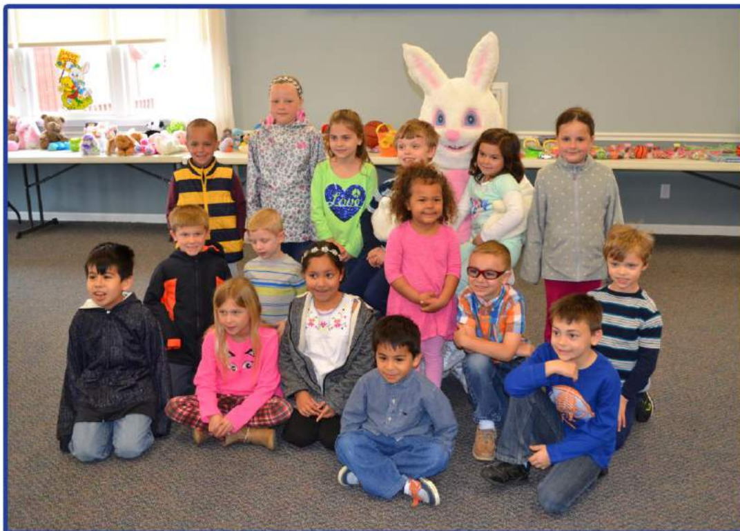
PETER RABBIT POSES FOR PICTURES WITH THE GUESTS AND HELPERS