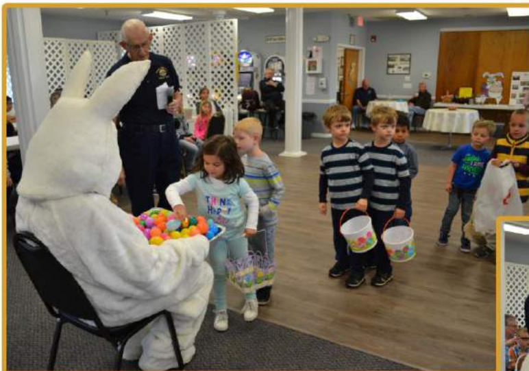
BIG AND LITTLE GUESTS COLLECTING EASTER EGGS